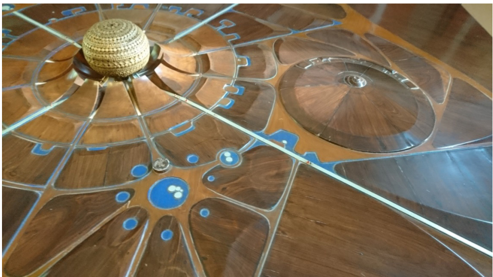
Figure 4. Scale model of Matrimandir in the Visitor’s Centre.

These hopes are expressed in the discontents of liberal researchers, with ‘commons’ as an index of refusal of enclosure in academic life, and in the ideological battle over the supposed ‘tragedy of the commons’, the false lesson drummed into us that the commons will always be destroyed by competitive individual interest; the commons are at the core of red green politics. It is clear that the commons have to be seized back in common struggle which is also necessarily feminist and anti-colonial struggle, and that this endeavour cannot be quickly bypassed by taking supposedly empty land and building the future there. Our future is always haunted by the past, by the commons, including in Tamil Nadu.