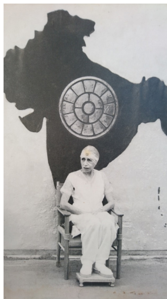
Figure 3. The Mother Mira Alfassa.

In some strange way this 'city of the dawn' has its roots in anti-colonial struggle. Sri Aurobindo was one of the leaders of the movement against British imperial rule, and took refuge in Pondi in the early twentieth century to avoid arrest, turning to a spiritual life which is commemorated in the Aurobindo Ashram, still there in the French quarter known as 'White Town'. After Sri Aurobindo died his partner Mira Alfassa, a French national from Morocco known as 'The Mother' gathered together followers to keep a legacy alive that would, she claimed, be spiritual, universal, as opposed to religious or ethnically particular. The Mother directed the construction of Auroville, and her image is still very much present there (Figure 3).