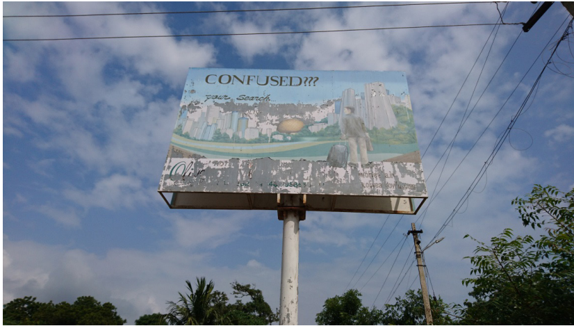
Figure 2. Sign for Auroville on the Pondi Highway.

In some strange way this 'city of the dawn' has its roots in anti-colonial struggle. Sri Aurobindo was one of the leaders of the movement against British imperial rule, and took refuge in Pondi in the early twentieth century to avoid arrest, turning to a spiritual life which is commemorated in the Aurobindo Ashram, still there in the French quarter known as 'White Town'. After Sri Aurobindo died his partner Mira Alfassa, a French national from Morocco known as 'The Mother' gathered together followers to keep a legacy alive that would, she claimed, be spiritual, universal, as opposed to religious or ethnically particular. The Mother directed the construction of Auroville, and her image is still very much present there (Figure 3).