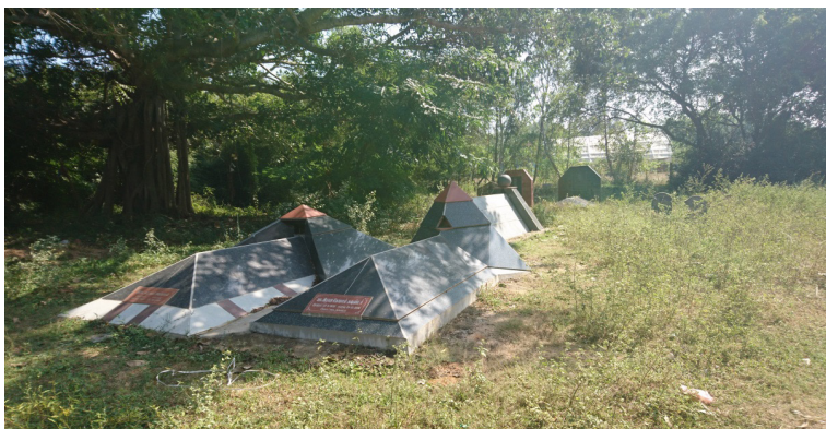
Figure 7. Auroville graves.

The narrow dirt track paths are being replaced with brick and tarmac roads – the main one of which was ready to welcome Modi – and there has been an exponential growth of private cars since the tsunami, private cars and mobile phones and even, hard for a 1968er to comprehend, separate gated communities. And the ecologists are on the back foot, with a proliferation of throwaway non-recyclable goods appearing in Auroville. It seems that on this common land which was bought from Tamils and enclosed to protect itself from the Tamil villagers, and whose labour it relies on to keep going, there are few common projects. Instead it is every man for himself, expected to live and let live and, better, encouraged to be an entrepreneur with a business from which a sizeable cut will go to the central authority. Businesses now include Australian spirulina, Austrian paper, Israeli wind-chimes and Tamil dolls (all of these national designations dissolved, of course, into an overarching ‘Aurovillian’ universal identity, and a host of organic cafes for the tourists who come to marvel at what has been done and what may be. The futuristic architecture of Auroville speaks of the hope of the commons but also of enclosure, a paradox built into the land. There is a simple graveyard with futuristic marble monuments surrounded by grassland