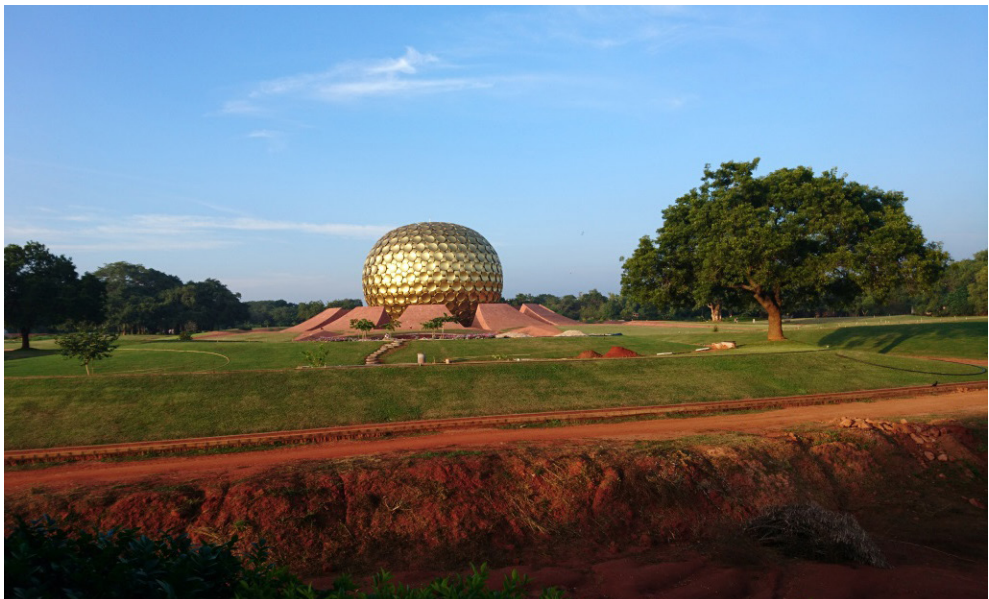
Figure 1. The Matrimandir.

Auroville is a futuristic city, at least that was the plan, and its fate tells us something about the nature of utopian projects and about ‘the commons’. The commons were once our collective natural resources – land, air, water, energy – in the past, and are still there to be reclaimed together for the future. The commons will be ours again, taken from their enclosure as private property, and they ground every communist project. The commons were already there in many attempts to build utopian universal communities around the world, and there are glimmers of the commons now in many places, including in Auroville in south India. At its centre is the Matrimandir (Figure 1), of which more in a moment.