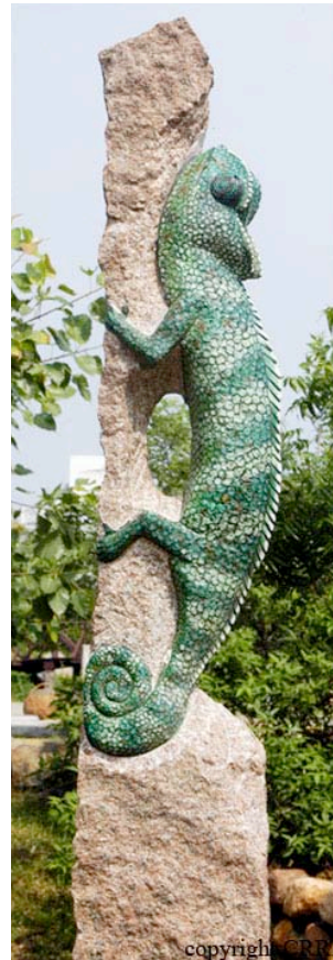
Image 5. Vertically implanted rough hewn granite pillars carved and painted over was found charming. This is a scaled up version of the Indian Chameleon Chamaeleon zeylanicus nearly 1m long. Tholkappia Poonga, Chennai.