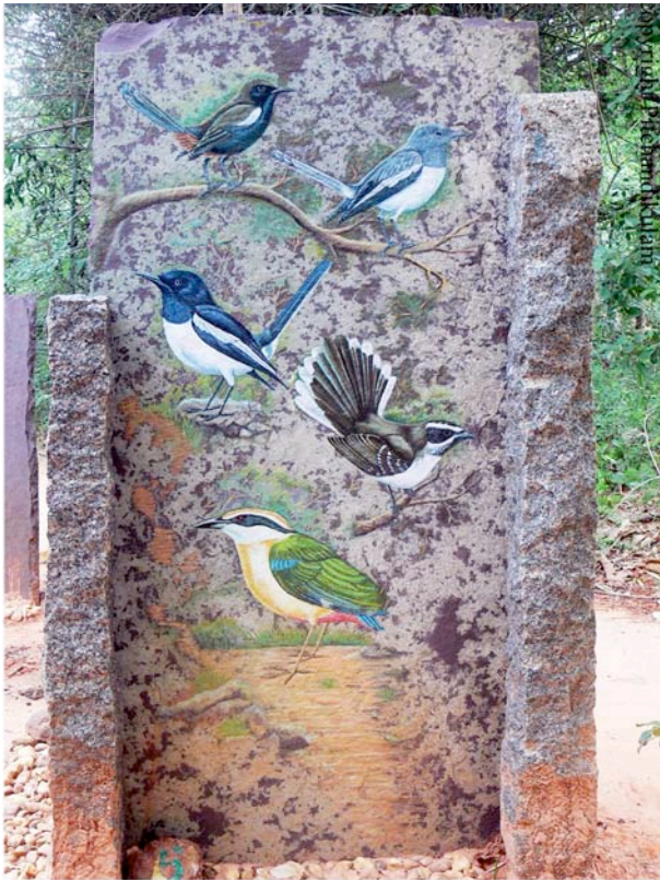
Image 3. Mild tampering is sometimes required to make a point – in this case to represent different niches occupied by birds in a coastal forest along the southern Coromandel Coast. That is why the ground has been painted in, but very minimally. The natural 'cloudy' tone of the stone has been maintained to represent foliage. A minimal amount of green was used to make the subject stand out from the background. The use of rough cut granite pillars to frame the slab is another added touch. Species represented are Indian Robin Saxicoloides fulicata , Oriental Magpie Robin Copsychus saularis , White-browed Fantail Rhipidura aureola and Indian Pitta Pitta brachyura . Pitchandikulam Forest, Auroville.