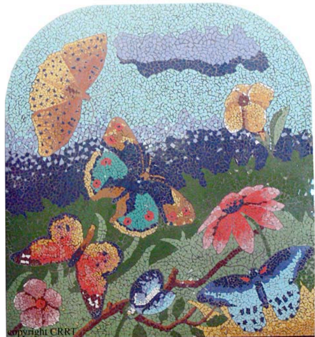
Image 14. Mosaic panel - one panel from a set of three depicting butterflies of the southern Coromandel Coast. Species represented: Common Leopard Phalanta phalantha , Blue Pansy Junonia orithya , Plain Tiger Danaus chrysippus and Blue Mormon Papilio polymnester . Tholkappia Poonga, Chennai.