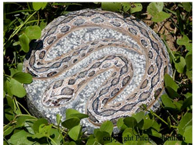
Image 9. A disused grinding stone carved and painted to represent a Russell's Viper Daboia russelii . Placed among herbage it has caused some consternation among the uninitiated. Pitchandikulam Forest, Auroville.