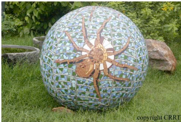
Image 16. A mosaic of a Giant Crab Spider Heteropoda venatoria holding its egg case adorns a ball approximately 1m in diameter. Tholkappia Poonga, Chennai.