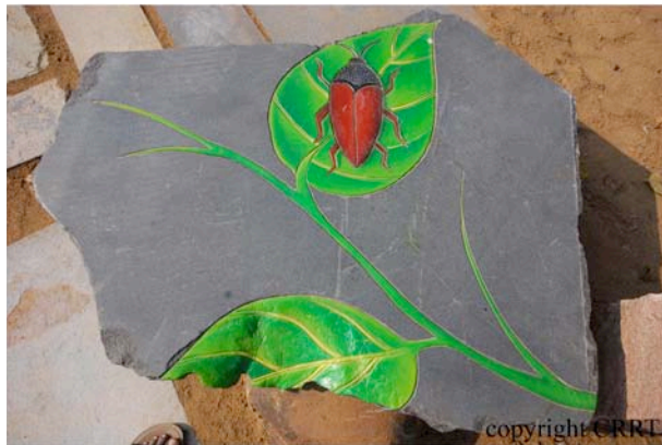
Image 12. Relief may represent form, but simple etching of outlines and painting the interior can also make a subject stand out from its surroundings. The challenge here is to use the shape of the base material to advantage and to create an 'effect'. Here the uneven edge of discarded waste from a TAMIN factory has been used to advantage. Species represented: Jewel Beetle Sternocera sp. Tholkappia Poonga, Chennai.