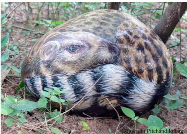
Image 4. A boulder painted to represent a life-sized curled up Small Indian Civet Viverricula indica . A photograph can do only 'so much' and the naturalness of this form has to be seen to be believed. Even seasoned wildlifers have been startled when confronted with this piece in its natural surroundings. Pitchandikulam Forest, Auroville.