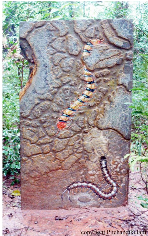
Image 2. Irregularity of form of the base material is always a challenge – in this case a 'broken' eroded stone slab like the last one, but with an even more irregular surface. The artist took the opportunity to represent a Centipede Scolopendra hardwickii seemingly moving under an overhang in its distinctive way. Pitchandikulam Forest, Auroville.

Mosaic: Wildlife art is a forum of imagery that will