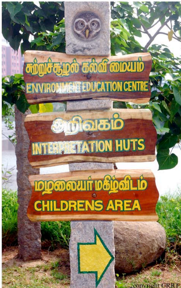
Image 7. A carved and painted Spotted Owllet Athene brama peering out of a cavity tops another rough hewn granite pillar to which planks with directional signage have been affixed. Tholkappia Poonga, Chennai.