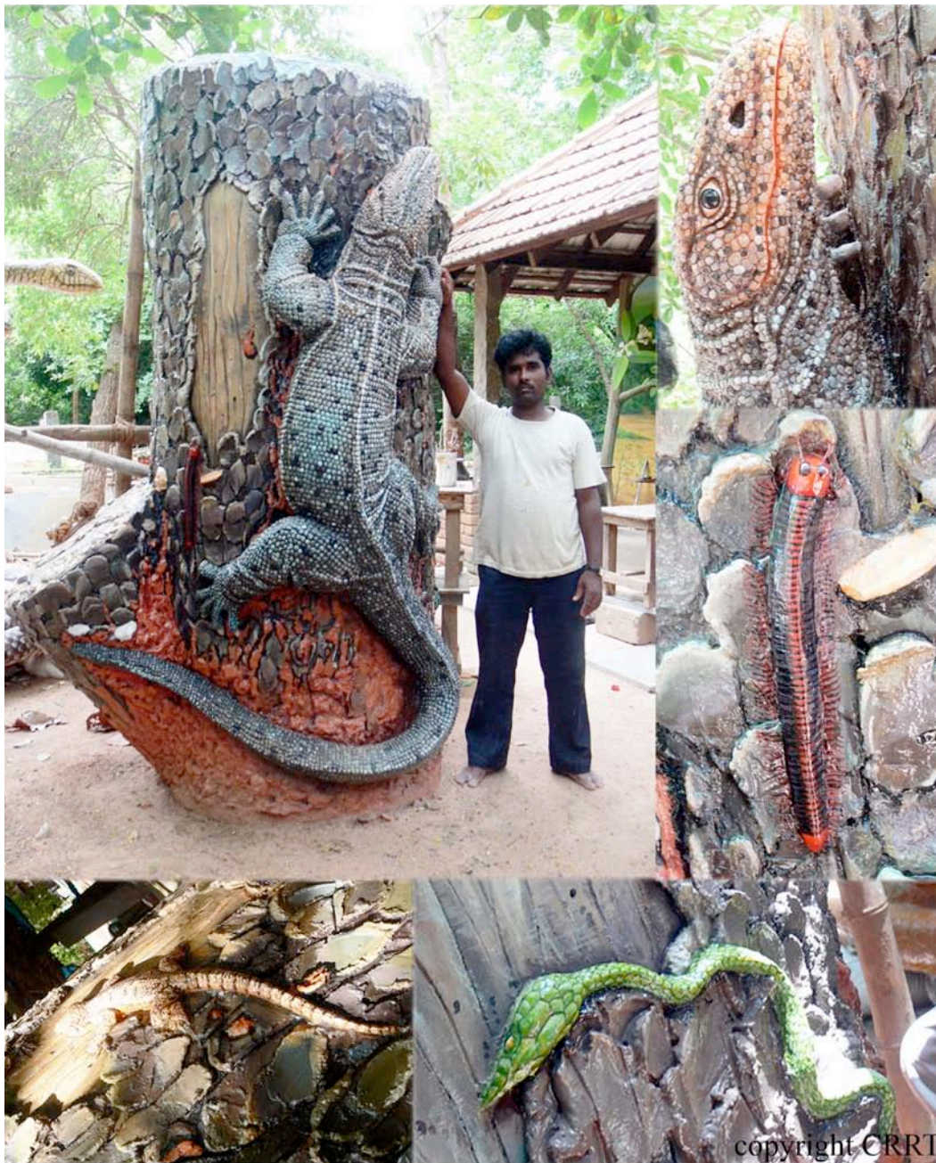
Image 11. Scaled up versions of animals were found to be dynamic and eye-catching. In this case an Indian Monitor Lizard Varanus bengalensis . In addition to the lizard, the tree trunk to which it clings also supports other faunal elements like the Green Vine Snake Ahaetulla nasutus , Brook's Gecko Hemidactylus brooki and Red-lined Millepede Xenobolus acaticonus in addition to others. Tholkappia Poonga, Chennai.