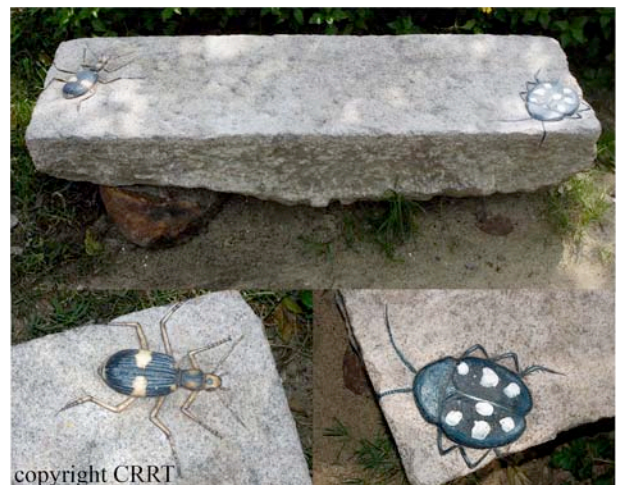
Image 10. An example of carved granite blocks used as benches. Species represented: Bombardier Beetle Macrocheilus niger and Domino Roach Therea petiveriana . Tholkappia Poonga, Chennai.