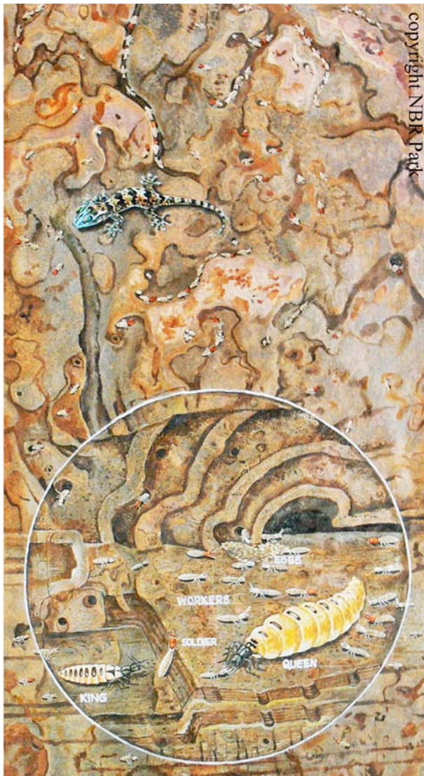
Image 1. The challenge of painting on stone is not to tamper too much with its intrinsic features. An eroded Kadappa stone slab was chosen to represent the interior of a termite mound with the highlight being the queen's chamber (encircled). An added touch was the utilization of a Termite Hill Gecko Hemidactylus triedrus that has just shed its skin (if a normal specimen had been represented it would not have stood out from the background). Nilgiri Biosphere Park, Anaikatti.

animals were found to be eye-catching and popular (Images 11–13). The onus here is on strength and durability since most, if not all, sculptures were designed to occupy public spaces where they are accessible to the public. Life size models have also been produced. It was found more satisfying to represent fish, amphibians, reptiles and birds rather than mammals because fur does not translate easily to this medium.