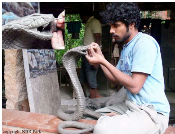
Image 13. An artist working on a yet to be finished life sized ferro cement model of an Indian Cobra Naja naja . Detail is crucial to such efforts – every scale has to be faithfully represented, including the small cunate scale among the infralabials. Commissioned by Nilgiri Biosphere Reserve Park, Anaikatti.