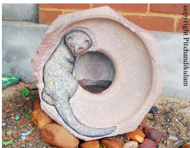
Image 8. Sometimes even waste can be utilized – in this case a disused mortar has been carved in relief and painted over to represent the Grey Mongoose Herpestes edwardsi . The challenge was to satisfactorily represent the 'ticked' fur in minimal detail which is the feature of the species and so hard to paint. Pitchandikulam Forest, Auroville.