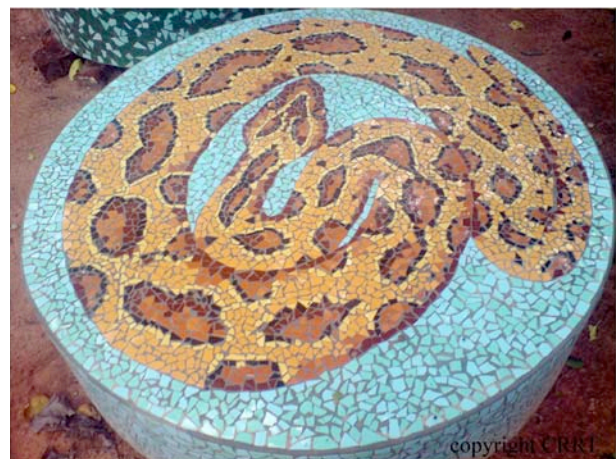
Image 15. Richness of colour is one feature of mosaic work that cannot be equaled by any other media. The cement ring which is used for seating is adorned by a Russell's Viper Daboia russelli . Tholkappia Poonga, Chennai.