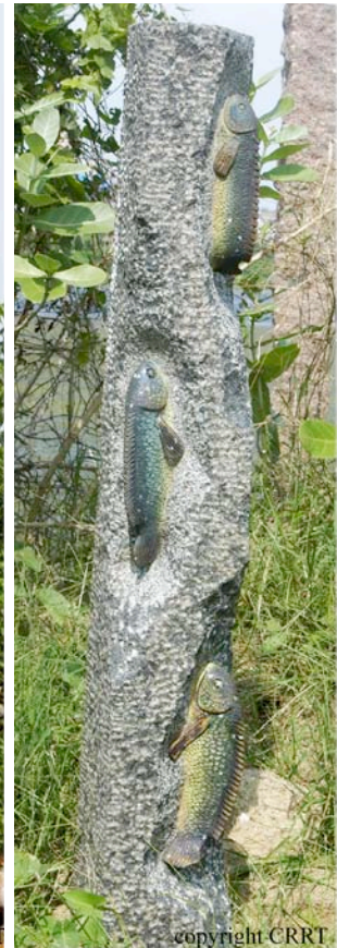
Image 6. Even life sized representations can be interesting – in this case three Climbing Perch Anabas testudineus . These fish were observed actually climbing up granite pillars of huts and walls at this particular site (the holotype was found in a palmyra tree). Tholkappia Poonga, Chennai.

unique way of seeing and sharing the world (< www.bbcwildlifemagazine.com/artist2009.esp >). Poster art, perforce being visually striking and designed to attract attention, was found to be one of the best tools for conservation education (Image 17). The genre of poster art produced was a combination of research poster and classroom poster as the need was to produce a simple 'one image' format that could sensitise people to the biotic wealth of the region as well as being scientifically accurate. Poster art from the time of Toulouse-Lautrec and Cheret had depended on colour, but black and white images were also used – for example, the poster publicizing the Exposition Universelle of 1905 at Liege. Both colour and black and white (ink) have been experimented with and the