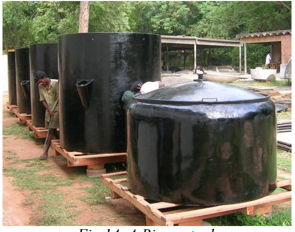
Fig 14. A Biogas tank

Buildings are constructed so that humans can carry out their various activities in an appropriate environment, efficiently, safely and in thermal comfort. The shell of a building is a barrier between the varying external environment, which can be uncomfortably hot or cold and stable comfortable internal environment. The building fabric acts as a moderator of climate but it is usual, during seasonal extremes, to use energy to maintain internal conditions.