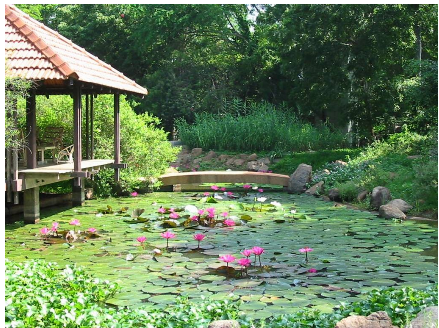
Fig.1 An aesthetically pleasing and a kind microclimate for the Afsaana's Guest house in Auroville