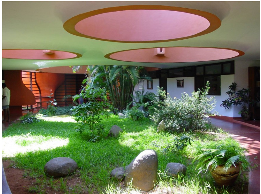
Fig 6. Efficient daylighting in an Auroville school interior

The potential from energy savings from daylight are large. The greatest savings in energy occur when in spaces where illumination in daylight is preferable to artificial illumination.