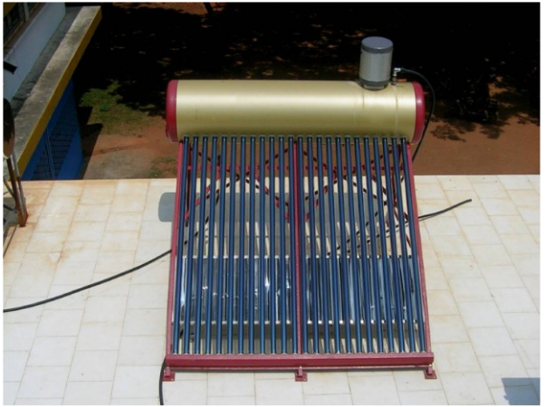
Fig 11. Solar Water Heater used in Auroville

Solar water heating systems are generally composed of solar thermal collectors, a fluid system to move the heat from the collector to its point of usage and a reservoir or tank for heat storage and subsequent use. The systems may be used to heat domestic hot water, swimming pool water, or for space heating. The heat can also be used for industrial applications or as an energy input for other uses such as cooling equipment.