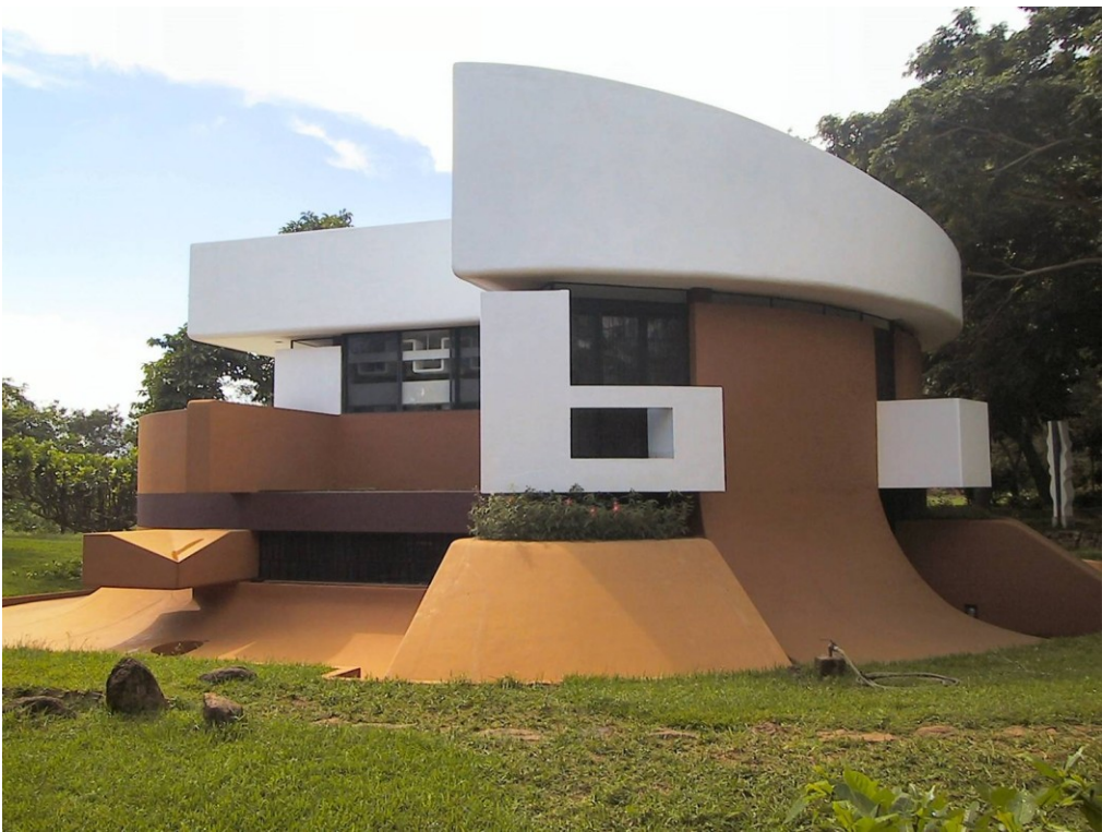
Fig 3. A Building in Auromodele demonstrating the nuances of a superior Building Form

Note the sweeping curves and open spaces encouraging the free flow of air. The form is such that it receives optimum daylight without heating the building excessively which minimizes the use of artificial lighting and cooling.