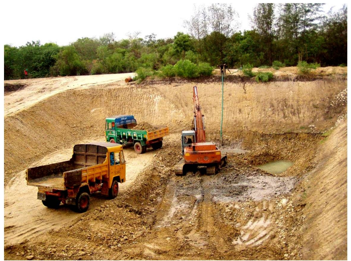
Fig 17. A trench being dug in Auroville for rainwater harvesting

Common adopted methods in Auroville include afforestation of wasteland areas, building recharge structures, repair of the feeding channels to the tanks and awareness activities for farmers.