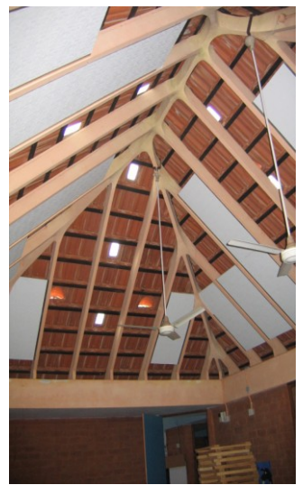
Fig 7. Another example of a sidelit room in Auroville