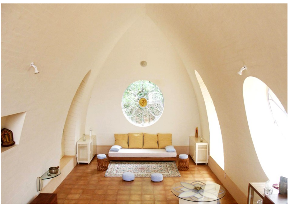
Fig 6. Interior of an Auroville house optimizing on daylighting

The majority of rooms are daylit using vertical side windows. There is a problem in illuminating rooms this way as daylight is mostly available near the window but finds difficulty in spreading to the points furthest from it. Auroville has experimented various methods to improve the spread of daylight by using side lit rooms. The philosophy is to change the direction of light flow so that instead of pooling near the window, it is projected up to the ceiling and reflected to the rear of the room.