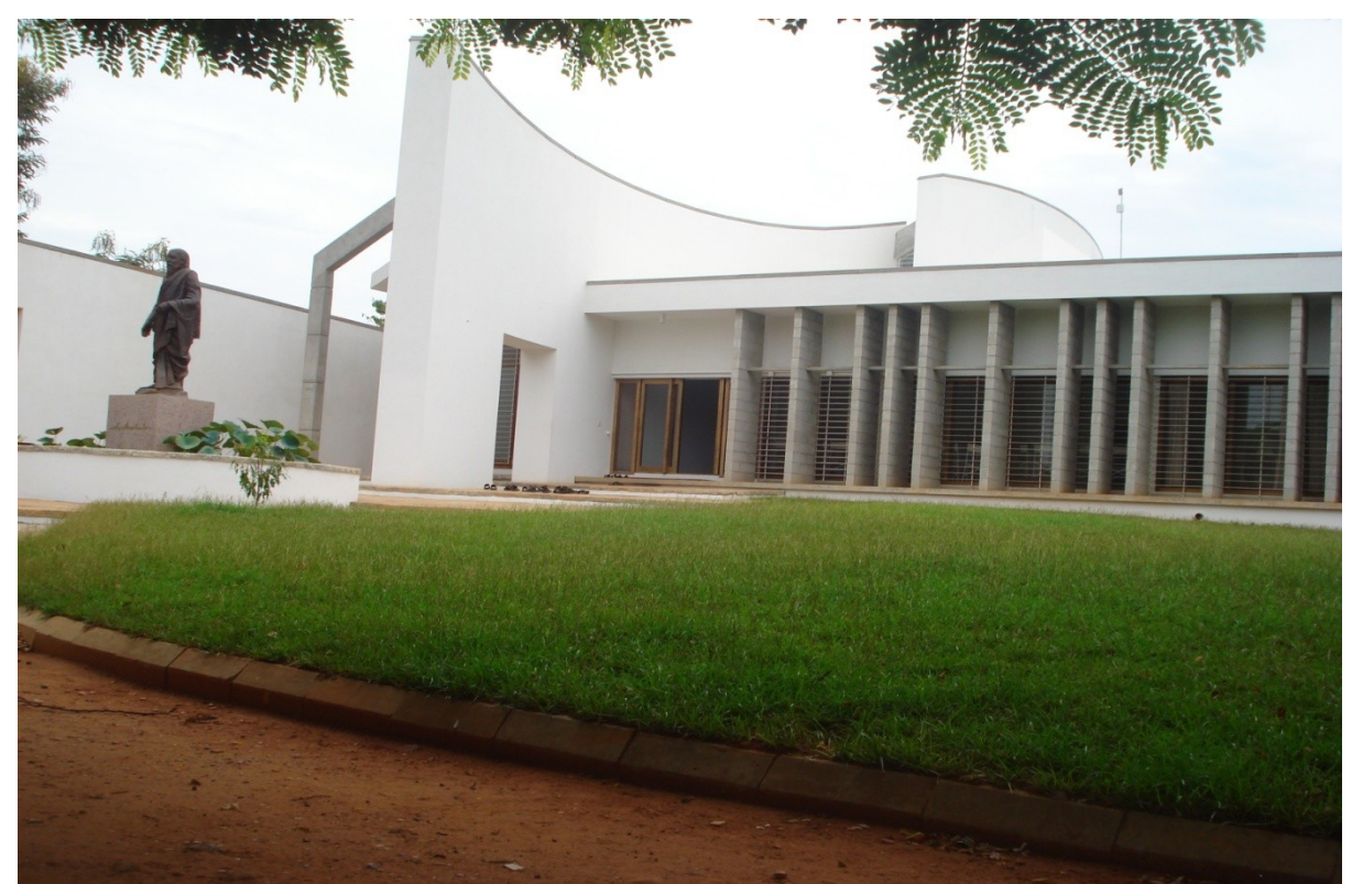
Fig 2. Savitri Bhavan: Ranch type design with added features to optimize daylight gains

Auroville has experimented with building forms right from its inception. Starting from the basic A huts in the early 70's, Auroville architecture has come a long way – Auroville architectural styles now famous the world over – combine unique forms built with sustainable building fabrics and the resulting buildings are perfectly adapted to the local microclimate. There are many factors that have an influence on the form of a building. Cost is a major factor here and simple cubical buildings are less expensive than complex forms. Functional requirements and aesthetics also have an important role in deciding the form.