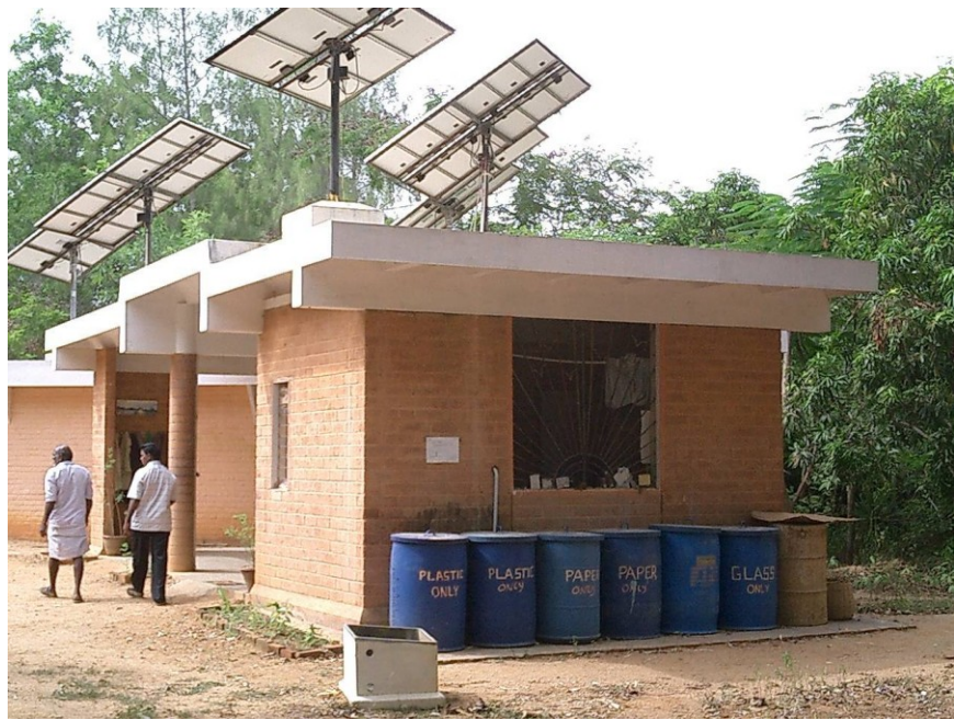
Fig 13. Solar Powered houses designed with Auroville Technology