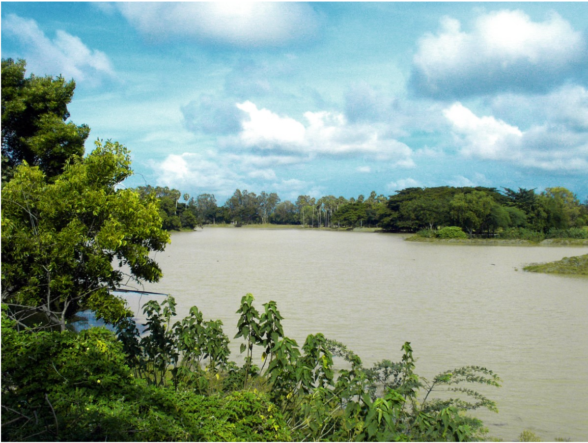
Fig 18. Afforestation around an artifical basin created to collect rainwater