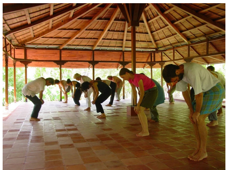
Fig 4. An Auroville classroom using natural ventilation and lighting

Most Auroville buildings ensure efficient ventilation and passive cooling techniques.