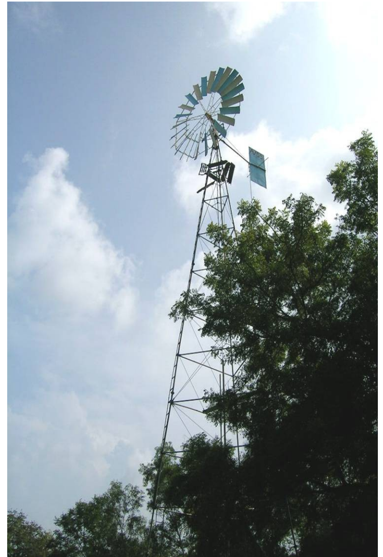
Fig 15. Wind Turbine at Auroville placed above the canopy line

Auroville receives unobstructed wind being on the coast of the Bay of Bengal. The aerodynamic drag induced by the forested canopy in Auroville slows down the wind speed to a certain extent – wind turbine rotor blades are therefore located at a height just above the forested canopy. Research is still underway to extract wind power effectively.