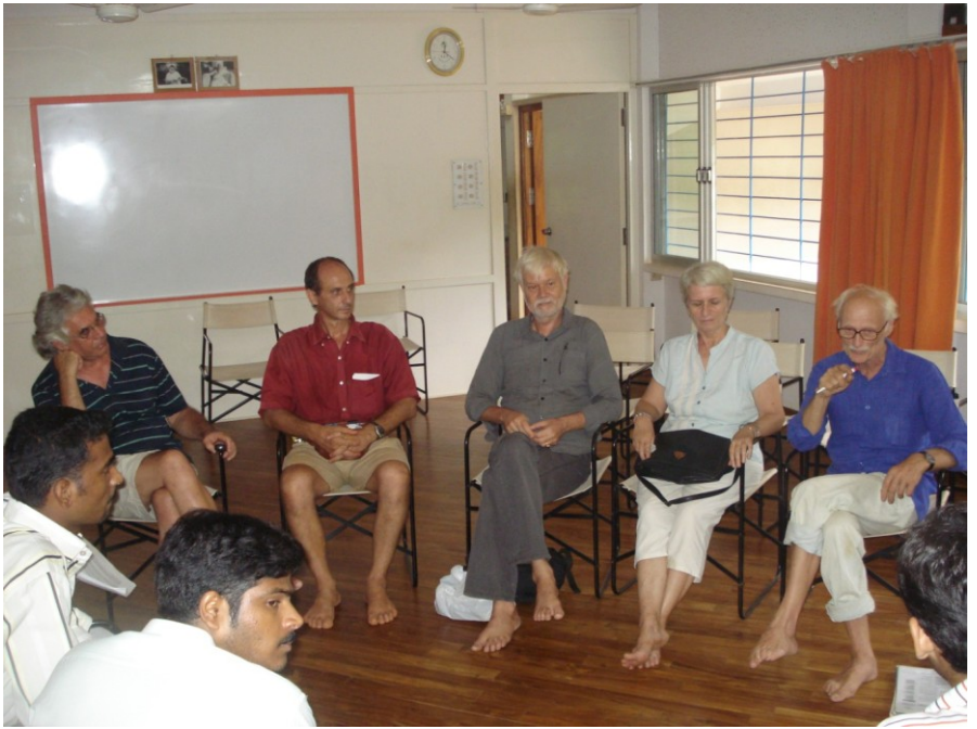
Discussion regarding sustainable practices at Auroville