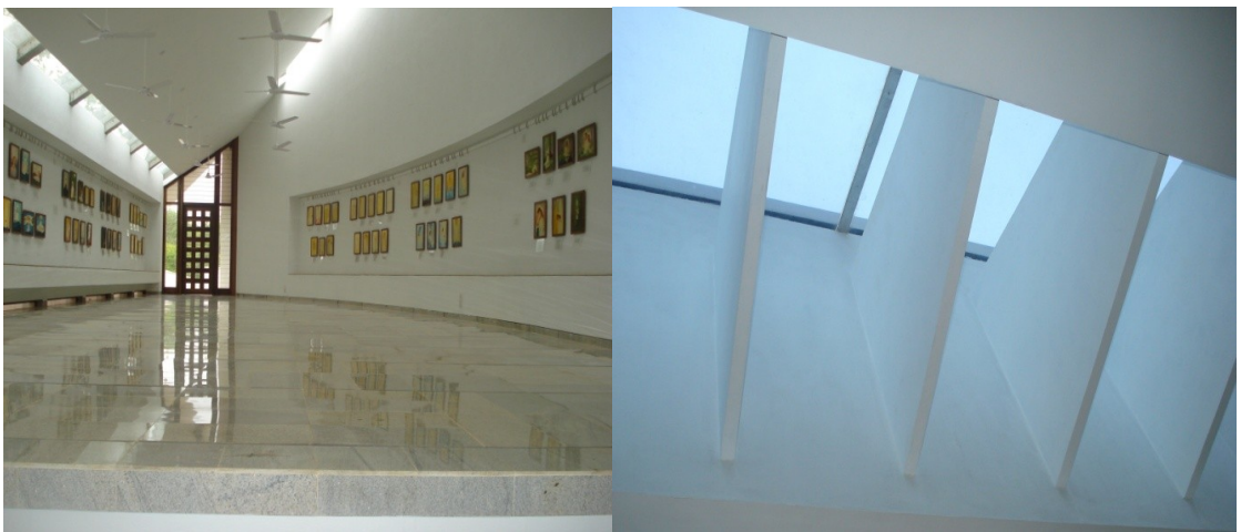
Fig 5. Efficient use of daylighting at Savitri Bhavan

Both these features have been brilliantly achieved in the Savitri Bhavan.