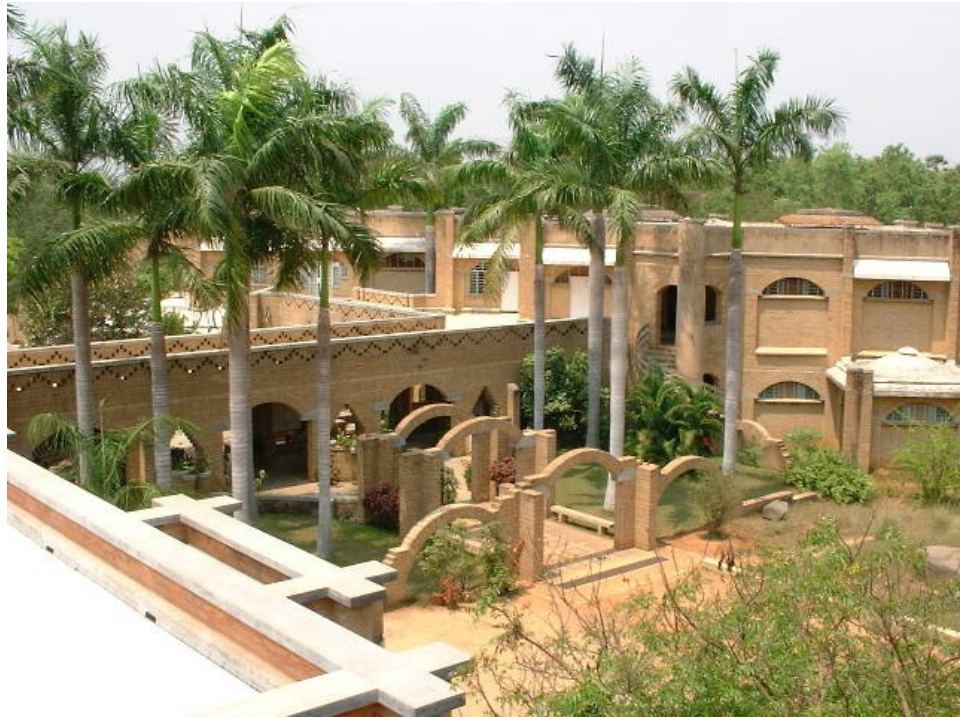
Fig 8. Auroville's Visitor's Centre made out of compressed earth bricks

A very high compression of up o 1.83 with 15 tons available force is achieved by the range of presses designed in Auroville