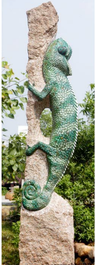
Image 5. Vertically implanted rough hewn granite pillars carved and painted over was found charming. This is a scaled up version of the Indian Chameleon Chamaeleon zeylanicus nearly 1m long. Tholkappia Poonga, Chennai.