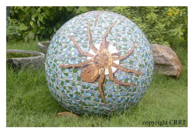
Image 16. A mosaic of a Giant Crab Spider Heteropoda venatoria holding its egg case adorns a ball approximately 1m in diameter. Tholkappia Poonga, Chennai.

of South Indian Art. Scherpe Verlag, Krefelt, xxxpp.