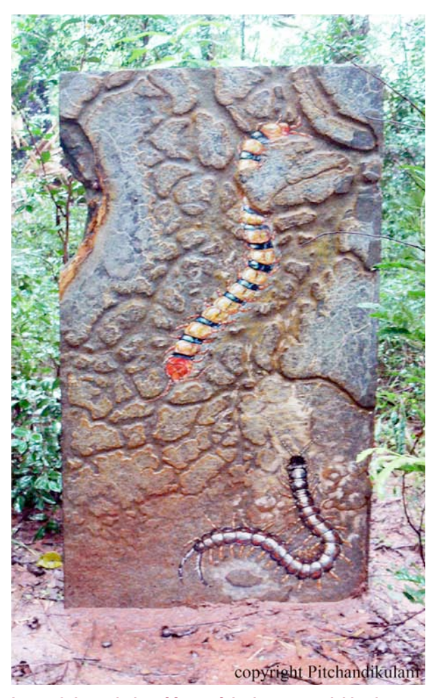
Image 2. Irregularity of form of the base material is always a challenge – in this case a 'broken' eroded stone slab like the last one, but with an even more irregular surface. The artist took the opportunity to represent a Centipede Scolopendra hardwickii seemingly moving under an overhang in its distinctive way. Pitchandikullam Forest, Auroville.

Mosaic: Wildlife art is a forum of imagery that will