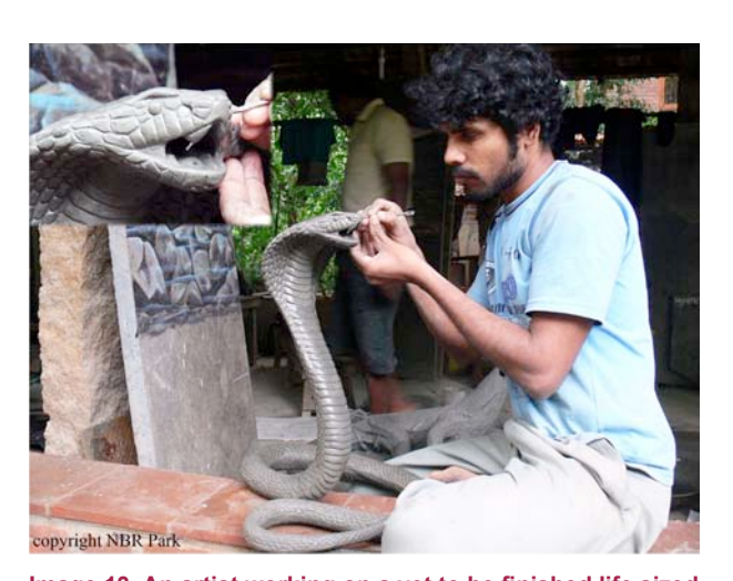
Image 13. An artist working on a yet to be finished life sized ferro cement model of an Indian Cobra Naja naja . Detail is crucial to such efforts – every scale has to be faithfully represented, including the small cunate scale among the infralabials. Commissioned by Nilgiri Biosphere Reserve Park, Anaikatti.