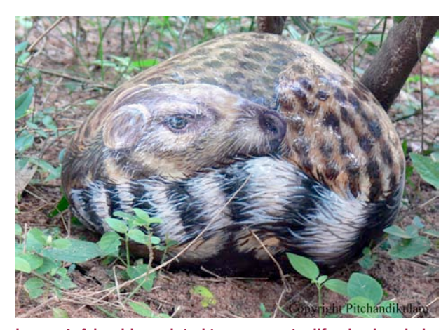
Image 4. A boulder painted to represent a life-sized curled up Small Indian Civet Viverricula indica . A photograph can do only 'so much' and the naturalness of this form has to be seen to be believed. Even seasoned wildlifers have been startled when confronted with this piece in its natural surroundings. Pitchandikulam Forest, Auroville.

unique way of seeing and sharing the world (<www.bbcwildlifemagazine.com/artist2009.esp>). Poster art, perforce being visually striking and designed to attract attention, was found to be one of the best tools for conservation education (Image 17). The genre of poster art produced was a combination of research poster and classroom poster as the need was to produce a simple 'one image' format that could sensitise people to the biotic wealth of the region as well as being scientifically accurate. Poster art from the time of Toulouse-Lautrec and Cheret had depended on colour, but black and white images were also used – for example, the poster publicizing the Exposition Universelle of 1905 at Liege. Both colour and black and white (ink) have been experimented with and the