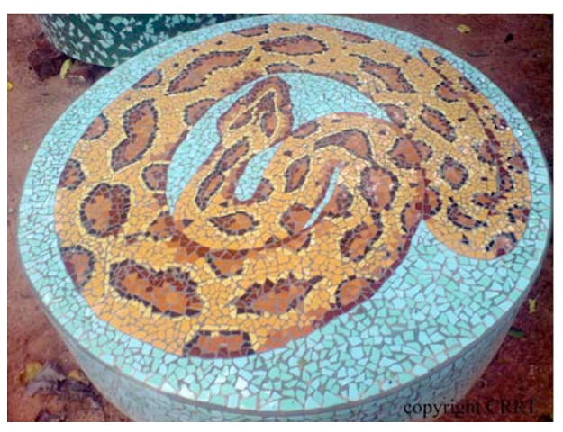
Image 15. Richness of colour is one feature of mosaic work that cannot be equaled by any other media. The cement ring which is used for seating is adorned by a Russell's Viper Daboia russelli . Tholkappia Poonga, Chennai.