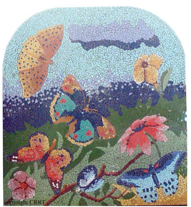
Image 14. Mosaic panel - one panel from a set of three depicting butterflies of the southern Coromandel Coast. Species represented: Common Leopard Phalanta phalantha , Blue Pansy Junonia orithya , Plain Tiger Danaus chrysippus and Blue Mormon Papilio polymnester . Tholkappia Poonga, Chennai.