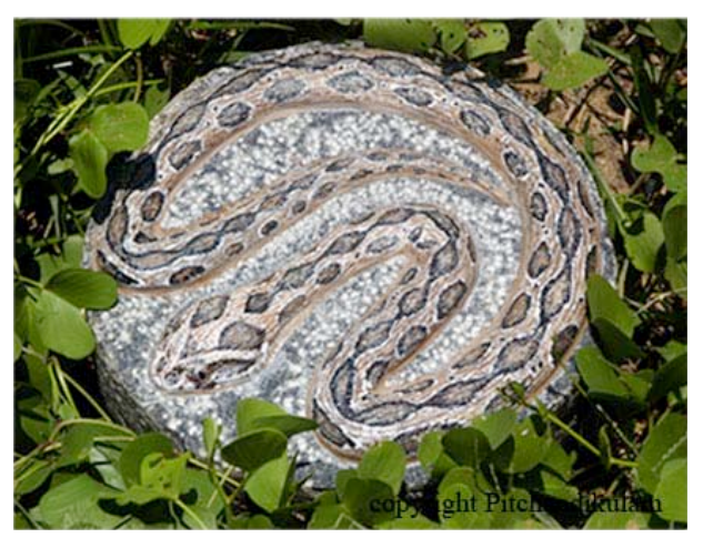
Image 9. A disused grinding stone carved and painted to represent a Russell's Viper Daboia russelli . Placed among herbage it has caused some consternation among the uninitiated. Pitchandikulam Forest, Auroville.