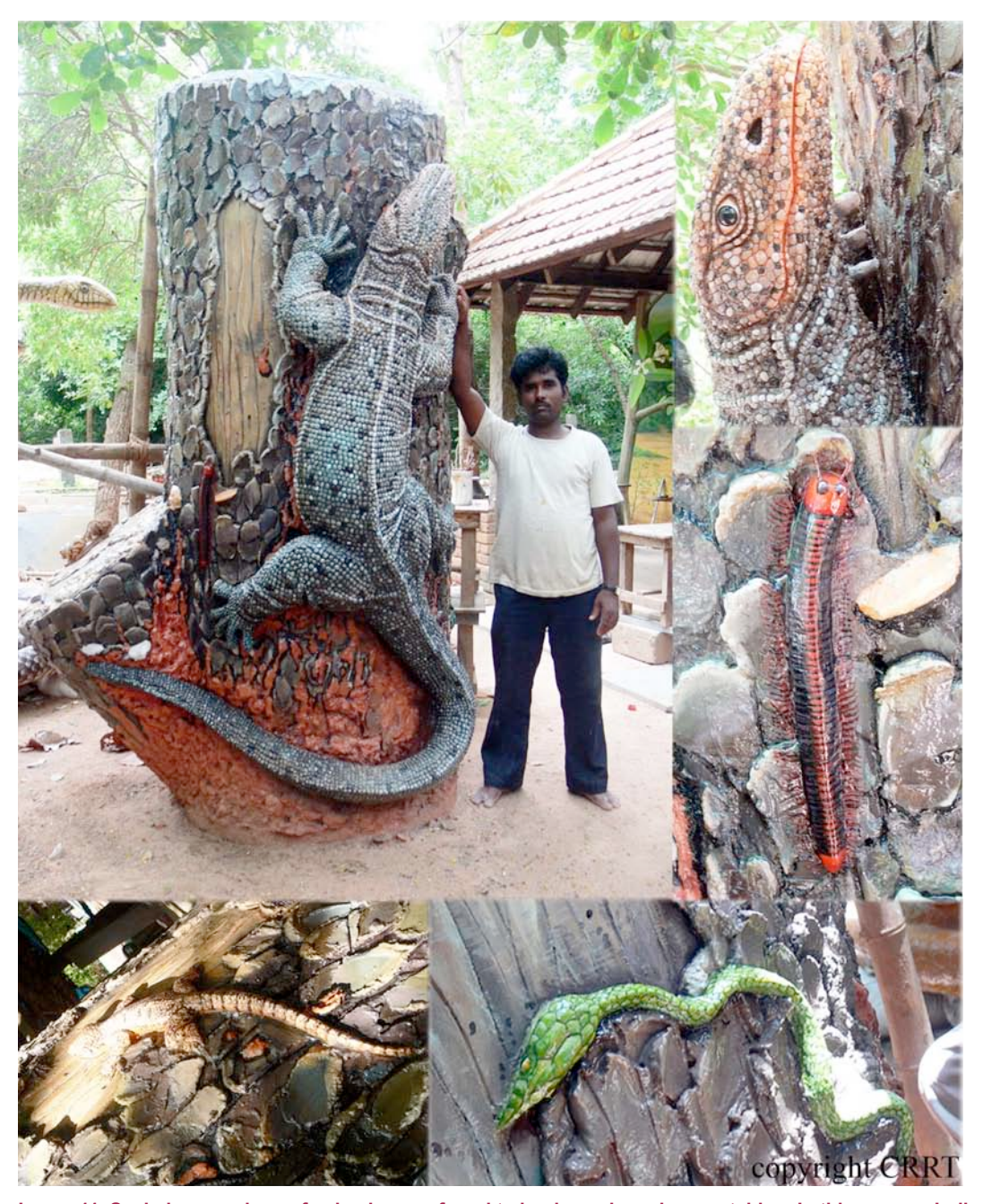
Image 11. Scaled up versions of animals were found to be dynamic and eye-catching. In this case an Indian Monitor Lizard Varanus bengalensis . In addition to the lizard, the tree trunk to which it clings also supports other faunal elements like the Green Vine Snake Ahaetulla nasutus , Brook's Gecko Hemidactylus brooki and Red-lined Millepede Xenobolus acaticonus in addition to others. Tholkappia Poonga, Chennai.