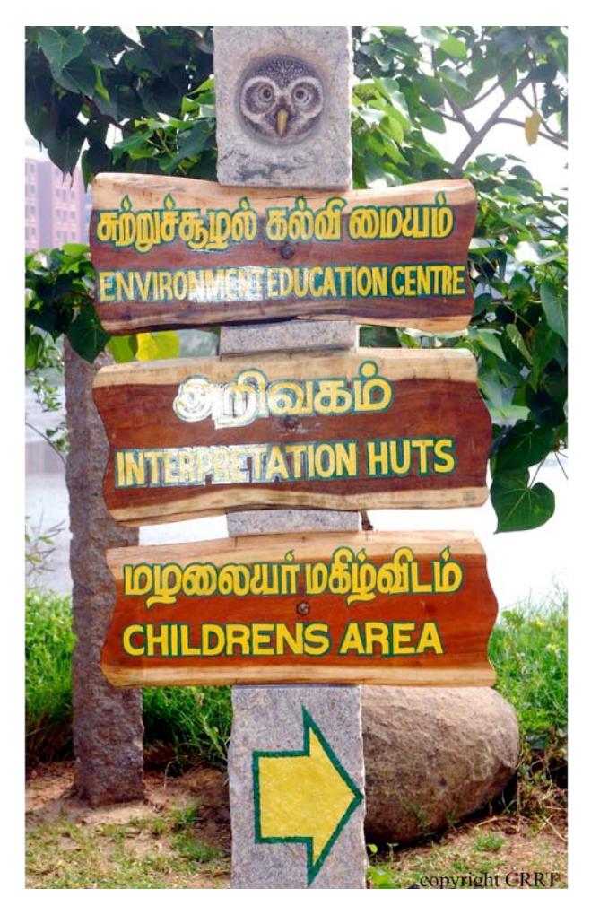
Image 7. A carved and painted Spotted Owlet Athene brama peering out of a cavity tops another rough hewn granite pillar to which planks with directional signage have been affixed. Tholkappia Poonga, Chennai.