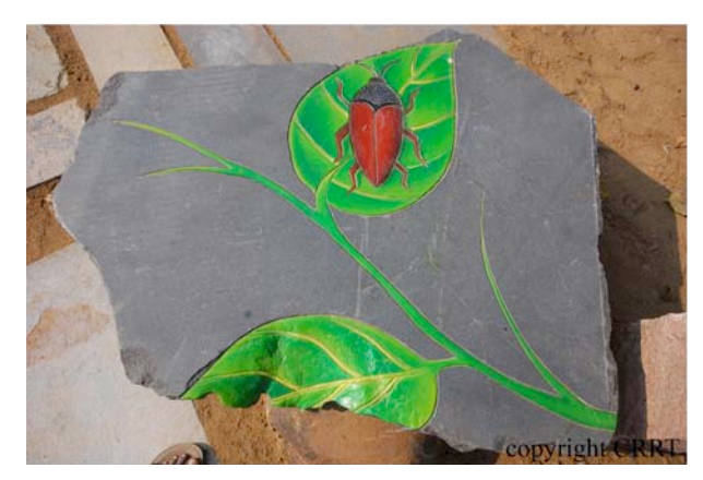
Image 12. Relief may represent form, but simple etching of outlines and painting the interior can also make a subject stand out from its surroundings. The challenge here is to use the shape of the base material to advantage and to create an 'effect'. Here the uneven edge of discarded waste from a TAMIN factory has been used to advantage. Species represented: Jewel Beetle Sternocera sp. Tholkappia Poonga, Chennai.