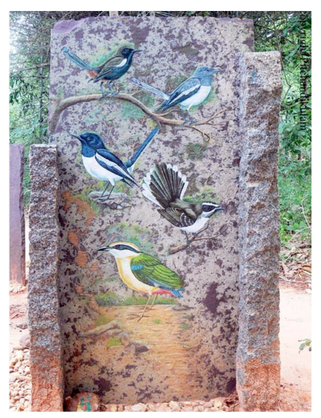
Image 3. Mild tampering is sometimes required to make a point – in this case to represent different niches occupied by birds in a coastal forest along the southern Coromandel Coast. That is why the ground has been painted in, but very minimally. The natural 'cloudy' tone of the stone has been maintained to represent foliage. A minimal amount of green was used to make the subject stand out from the background. The use of rough cut granite pillars to frame the slab is another added touch. Species represented are Indian Robin Saxicoloides fulicata, Oriental Magpie Robin Copsychus saularis, White-browed Fantail Rhipidura aureola and Indian Pitta Pitta brachyura. Pitchandikulam Forest, Auroville.