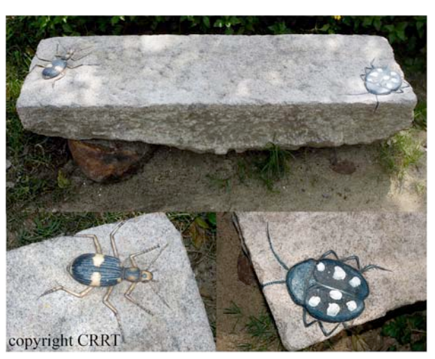
Image 10. An example of carved granite blocks used as benches. Species represented: Bombardier Beetle Macrocheilus niger and Domino Roach Therea petiveriana . Tholkappia Poonga, Chennai.